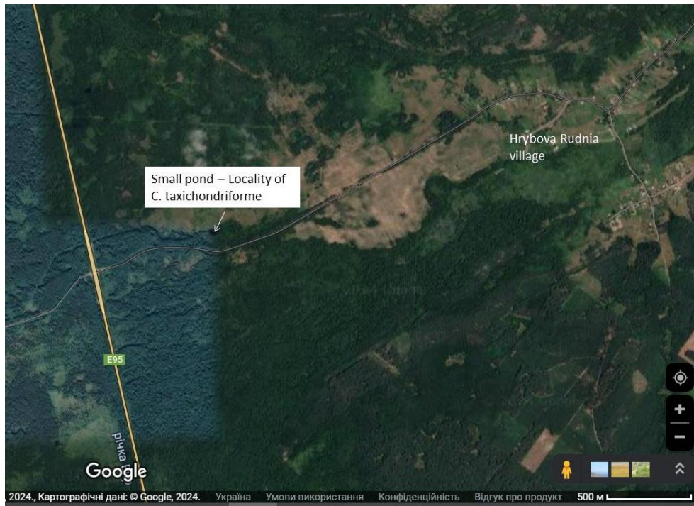
Fig.1. Google Maps view of the location of the sampling site

Ecological variables were measured with EZODO 8200M pocket multimeter (EZODO, Taiwan). Identification was done based on R. Lenzenweger's Desmidiaceenflora von Österreich (1999), and Palamar-Mordvintseva (1986).